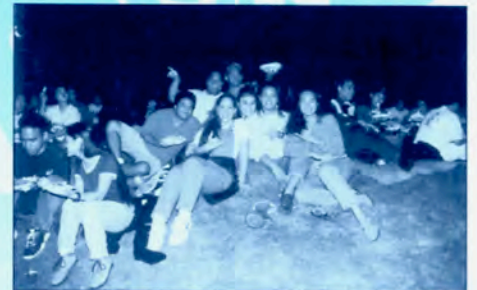
Sharing food and fun, these employees flash "shaka" signs during a break in the entertainment.