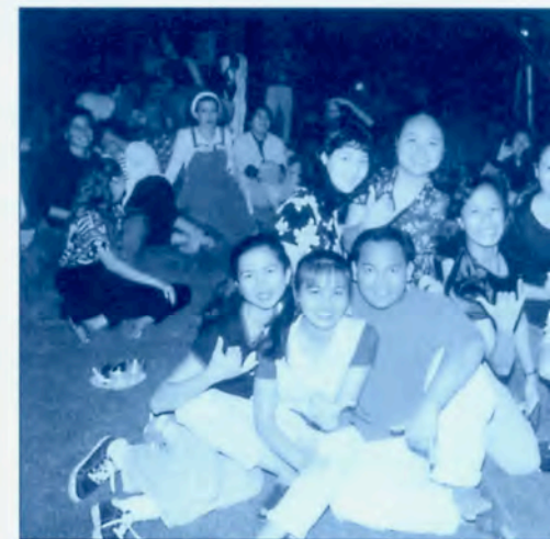
Employees relax and enjoy getting the