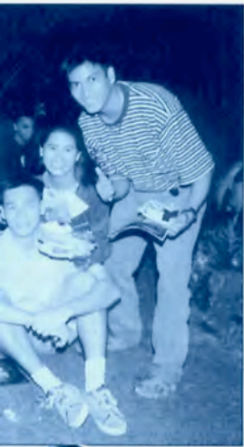
For the social evening.