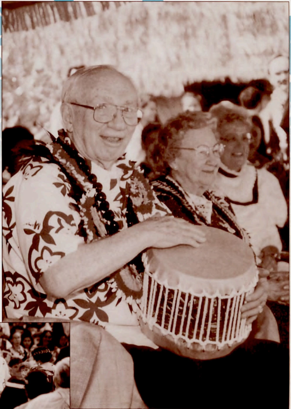
Above: President Hinckley tries out his gift of a drum in the Tongan Village.