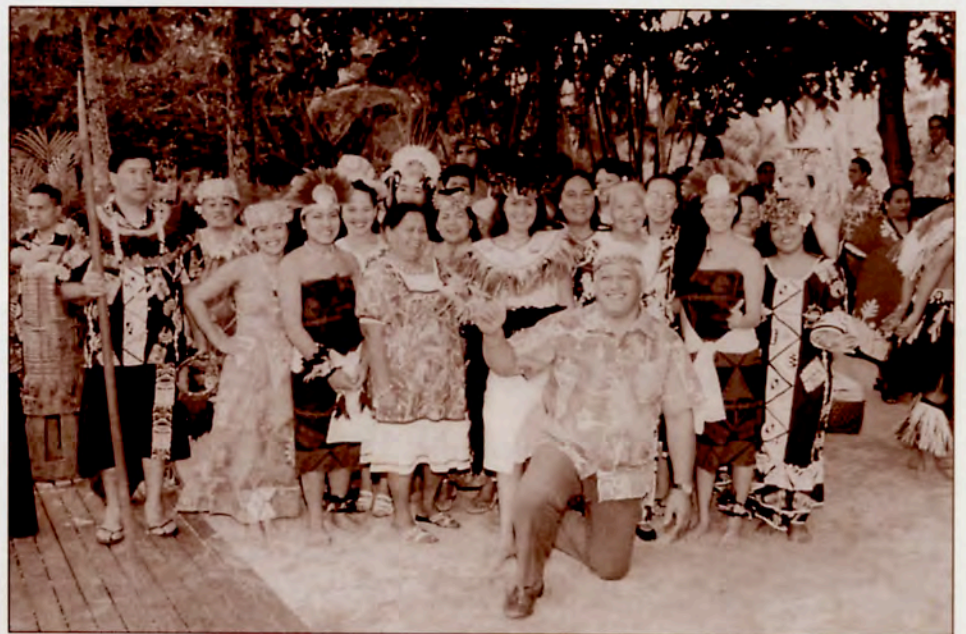
French Polynesia employees await President Hinckley's canoe.