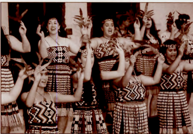
Above: Maori Village welcome. Top right: Employees from French Polynesia. Bottom right: Fijian Village employees await the visitors' arrival.