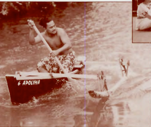
Canoe races were a popular audience event