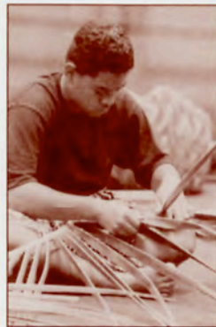
Neatness and speed counted in the weaving competition