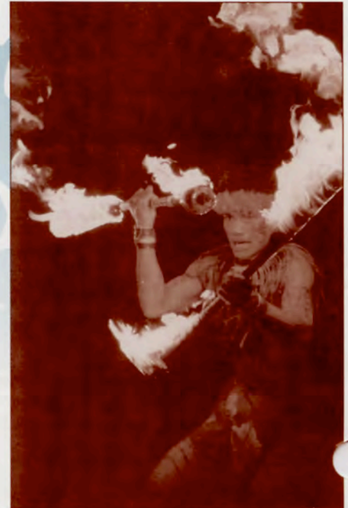
Competitors were fearless in their command of the flaming knives.