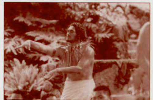
The level of performance and individual talent was extremely high - a fact that was much appreciated by the record breaking crowds in attendance