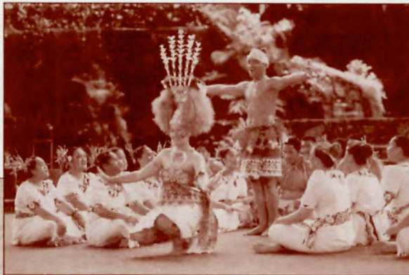
Elaborate hand made costumes are used in the performances