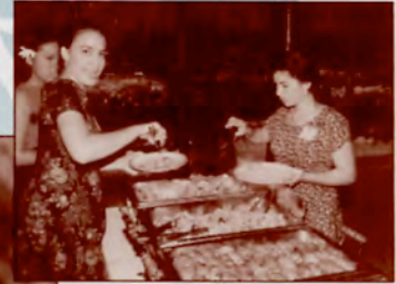
Participants enjoy island foods at the evening banquet