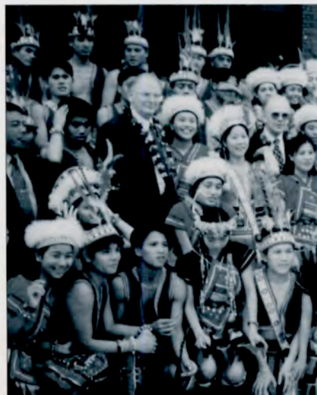
On a visit to Taitung, Taiwan, President Moore poses with a local entertainment group.

During the week May 18–25, 1999 I was under instruction to investigate the possibility of forming a branch of the Church on Christmas Island, Republic of Kiribati.