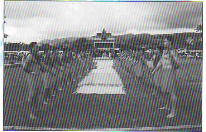
Young Samoan warriors await the arrival of the Malietoa.