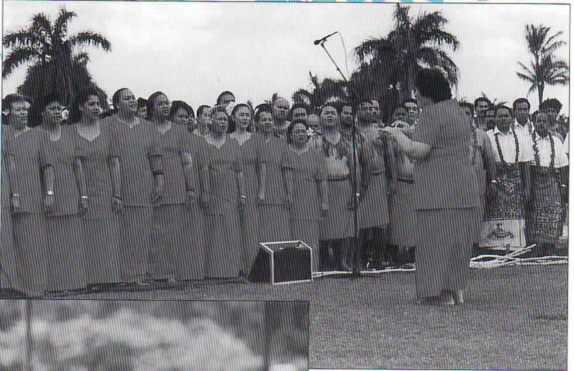
The Samoan Community Choir sings the Samoan translation of "Onward Christian Soldiers."