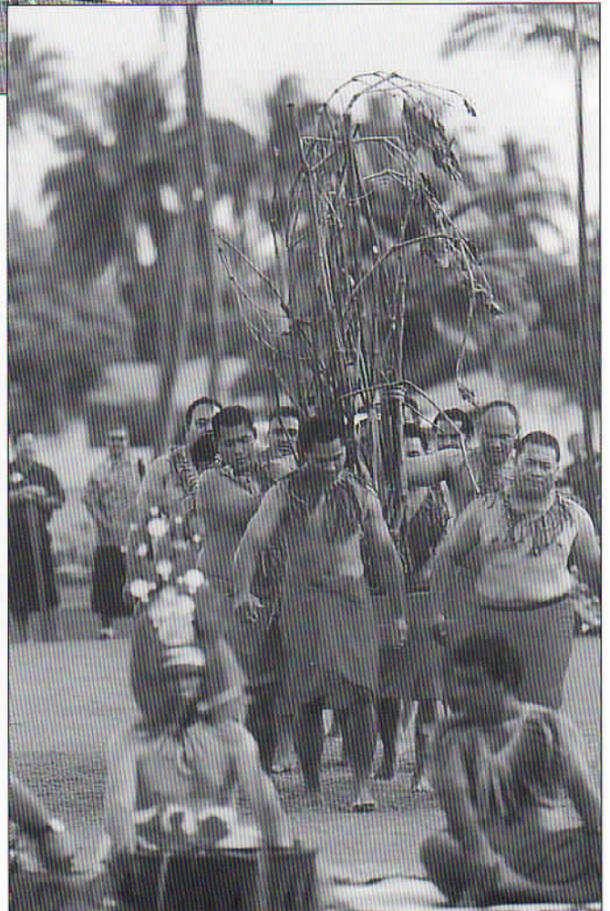
Samoan Community Aumaga present the green ava for the royal kava ceremony.