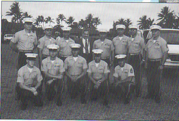
A U.S. Marine Corp made up of servicemen of Samoan ancestry pose with U.S. Congressman, Faleomavaega Eni Hunkin, after participating in the investiture ceremony.