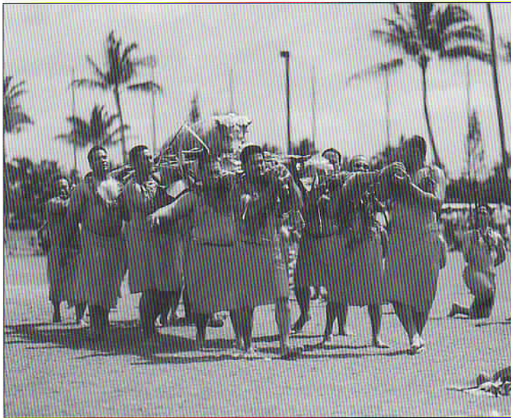
Samoan Community Aumaga present a pig for the Sua.