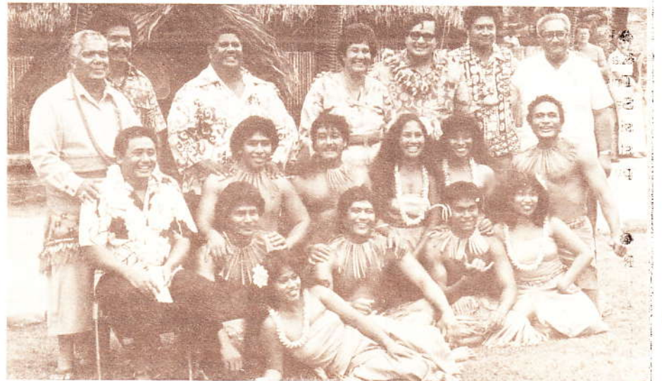
Winning the "Pageant of the Long Canoes" was the Samoan village, joined here by several PCC friends.