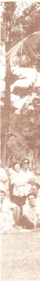
Our Tongans "Tau'olunga."