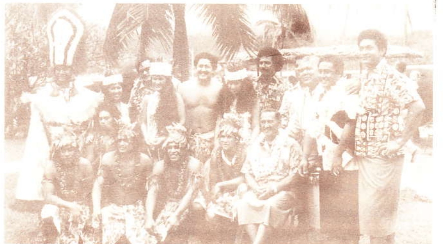
Placing second in the canoe pageant contest was this proud group from Tahiti and a few chiefly well-wishers at the far right.