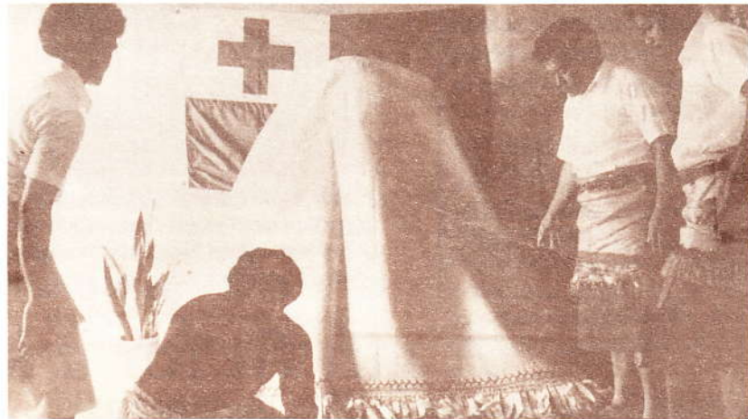
The 120-pound bust of the Tongan king is carefully placed on fine mats and tapa cloth for the presentation.

The sculpture will be shipped to Tonga later this month to coincide with the king's return to his homeland from New Zealand.