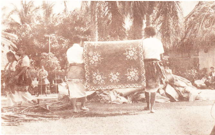
Lovely tapa and fine mats such as this one, gifts from Tonga's royal family to the Center, were formally presented during the Cultural Day celebration.