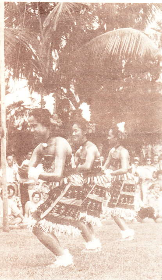
sters showed off their grace when they performed the