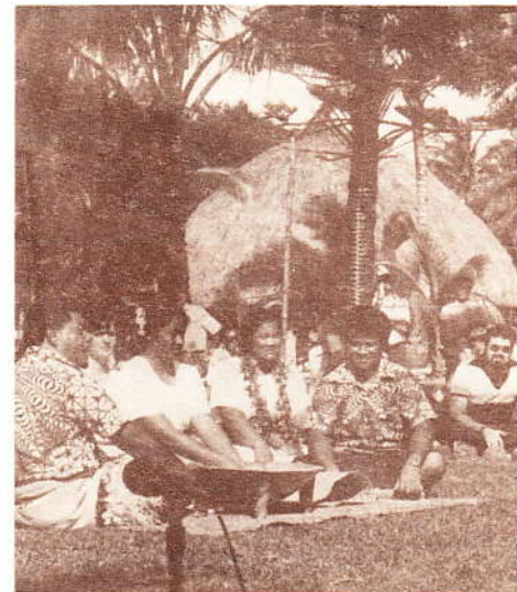
Visitors also had the chance to view a