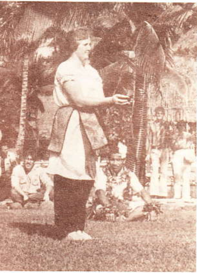
traditional Tongan kava ceremony.