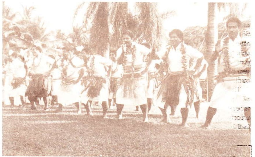
The men of the village really got into the festive mood with their spirited dancing.