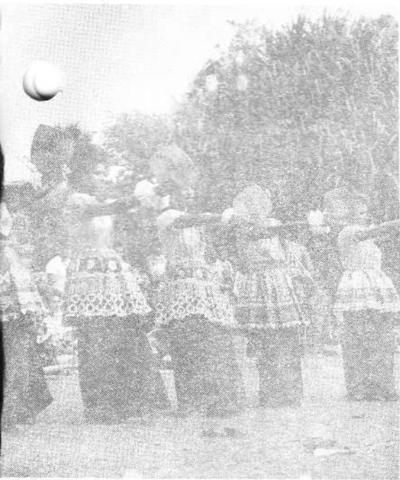
in this traditional fan dance. Crowds of visitors program, held at 1:45 p.m. in the celebration area