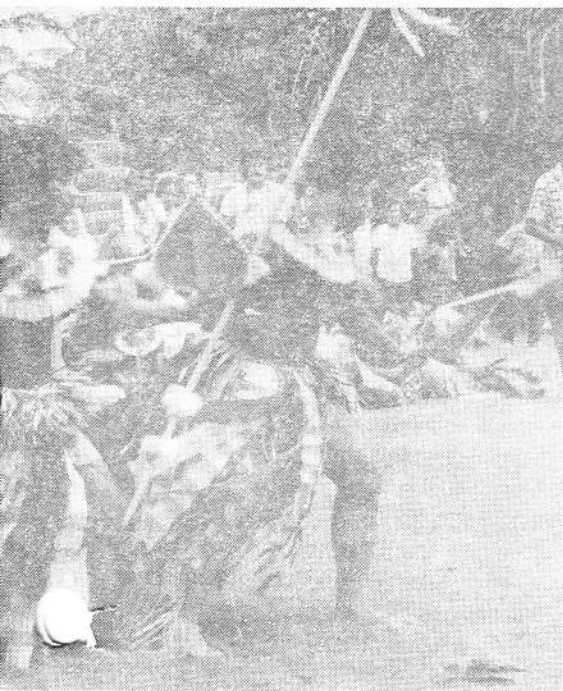
this exciting spear dance. Cameras kept clicking exhibited their skill, strength and vitality.