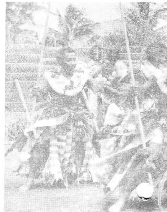
It was the warriors turn to show off their style in a dance away as these Fijian youths in colorful costume