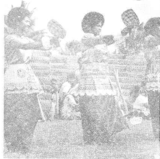
Fijian ladies exhibited their poise and grace as they gathered to enjoy the formal Fijian Cultural Day near the Tongan village.