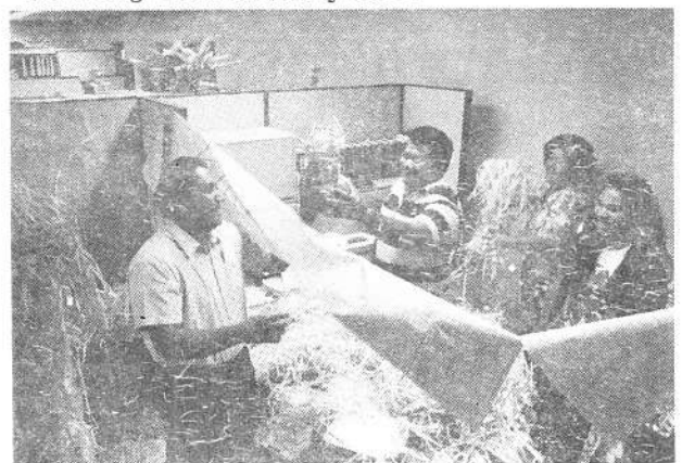
"We had this statue of you hand carved. . ."