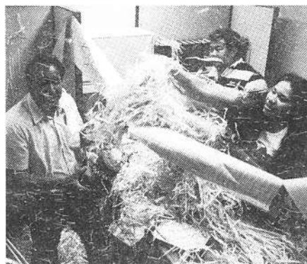
"Last one out has to clean up!"