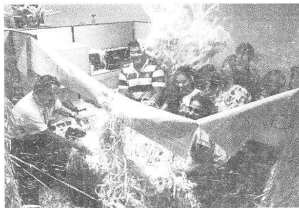
"Where's my present? I know you bought me one."