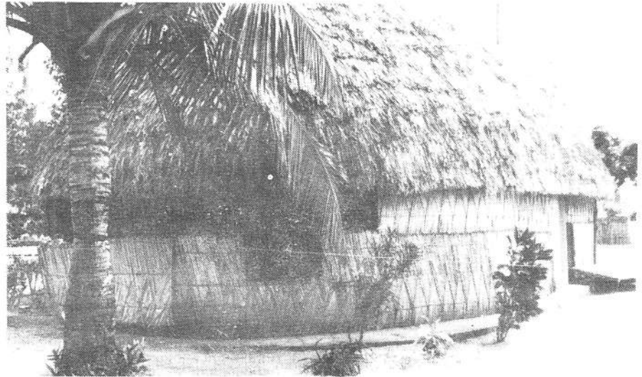
Dark cloths cover the windows of the Tongan village's family dwelling, which is presently being refurbished.

According to Chief Tevita Tau-moepeau, all work should be completed by January 10, at which time the village will be celebrating both its new look and cultural day (postponed from December 6).