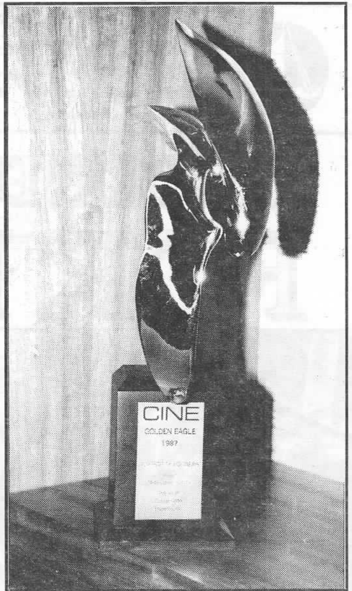
The Center finally receives the CINE Golden Eagle for the Portrait of Polynesia