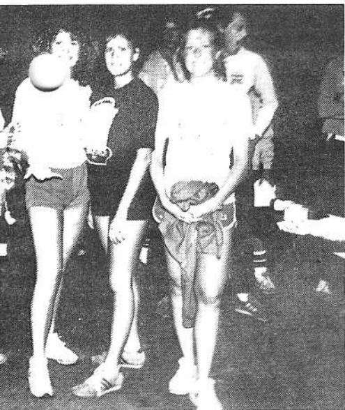
Women set to go.