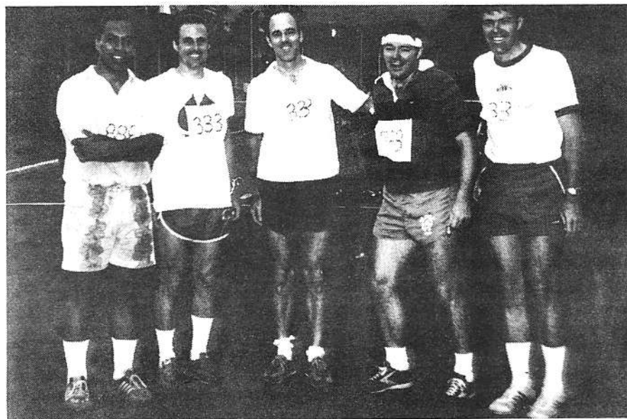
The "over-the-hill gang."