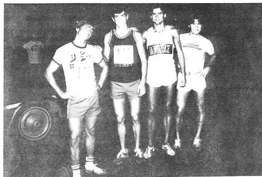
The 111's minus one - Marathon winners.