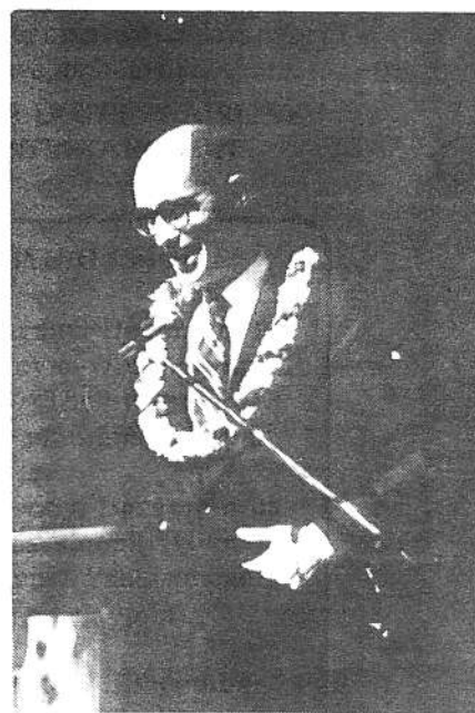
Dr. Hal B. Eyring