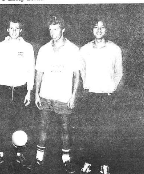
2nd place winners.