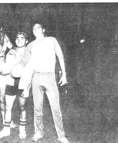
3 Early Birds.