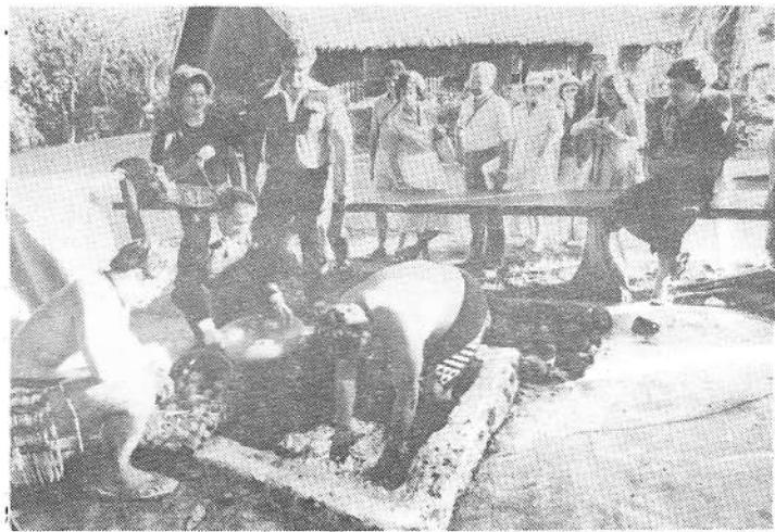
The Haangi (food preparation) demonstration in the Maori Village this week was a hit with Center visitors.

The entertainment program begins at 1:30 p.m. Don't miss it! This promises to be a day to be remembered.