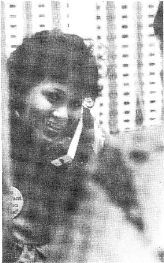
What time is our 1:00 show?