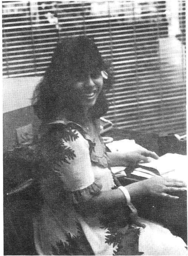
Who's our Manager this week?