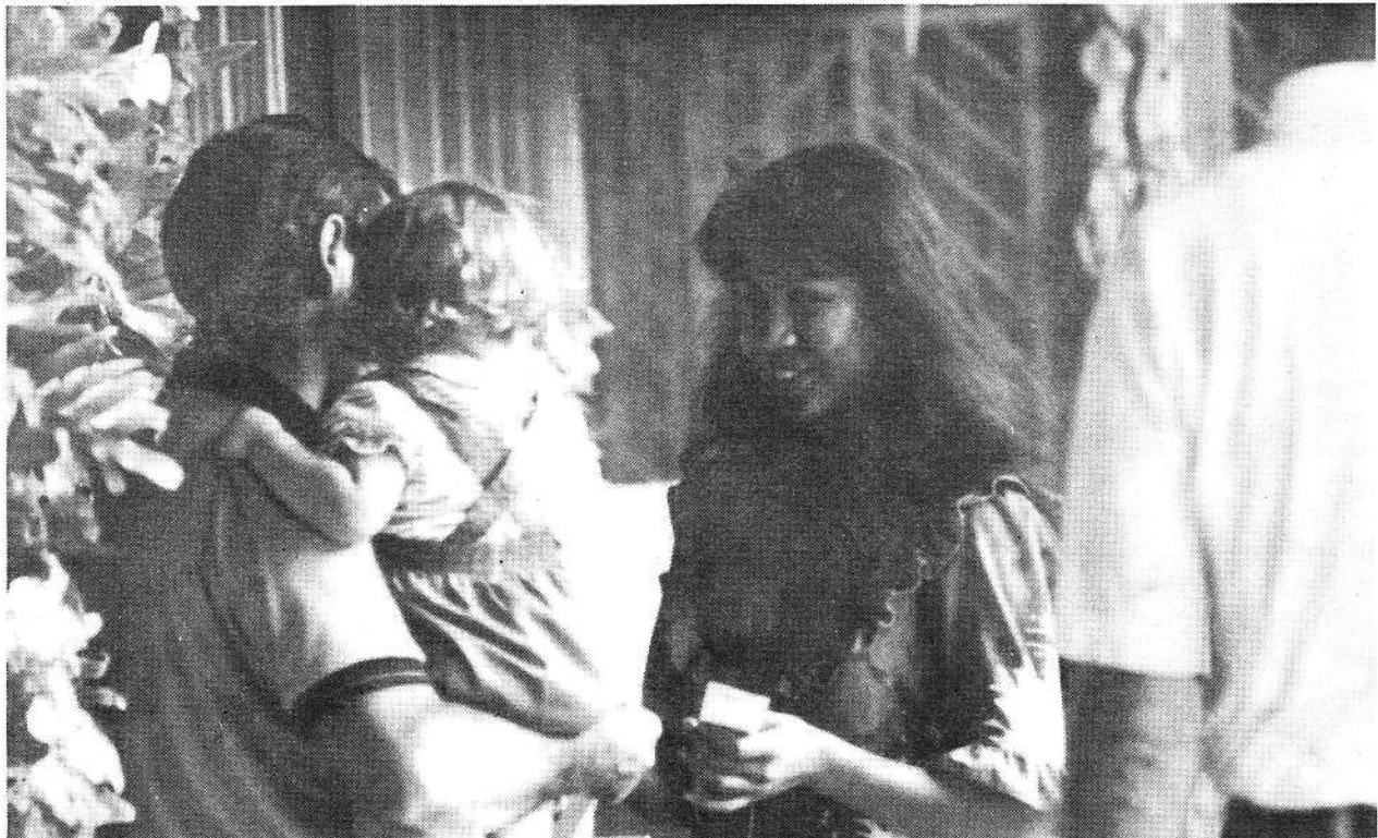
I'm sorry Sir, you can't pass for under 5 years old...