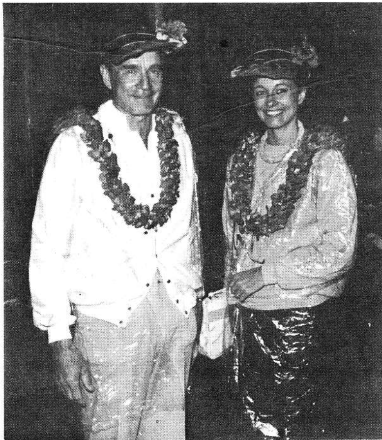
Ready for rainy weather...