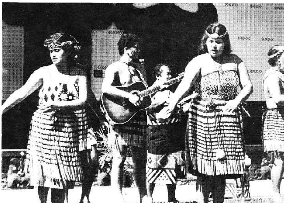
Maori village workers perform during Waitangi Day

Today the New Zealand Maoris celebrate Waitangi Day by re-enacting the signing of the treaty. Dignitaries from Ngahauewha (The Four Corners) come to participate in the signing and join in the festivities. Brother Kaka from our Maori village mentions that the Waitangi Bay is known as the Bay of Islands and is a very beautiful place to visit.