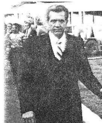
Elder Boyd K. Packer