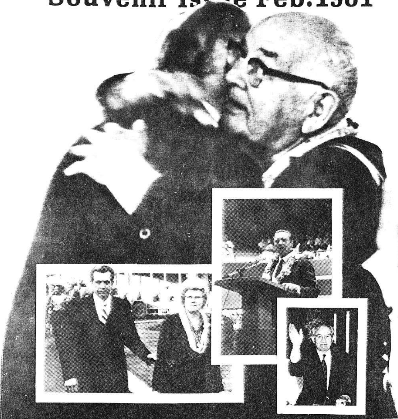
Prophet Embraces Spirit of Laie