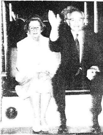
Hinckleys wave from PCC cart.