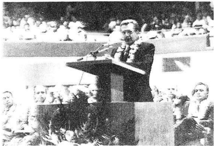
Elder Packer addressing audience.