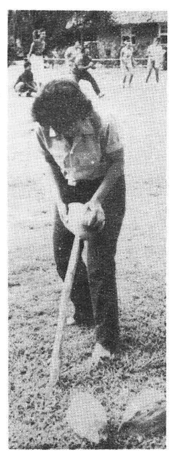
Congratulations to all who entered for their sportsmanlike conduct and athletic performances.