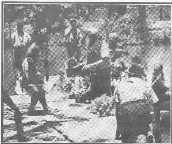
The Samoan Village presented a beautiful Tanoa bowl.