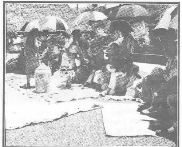
The Tongan Village presents a platter and basket in a formal ceremony.