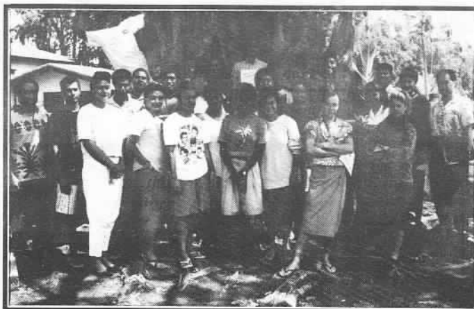
Our newest arrivals. Welcome one and all!

We would like to welcome our new students from the South Pacific, who have joined our ranks at the Center. They are presently undergoing their orientation program with BYU-HC and the Center.