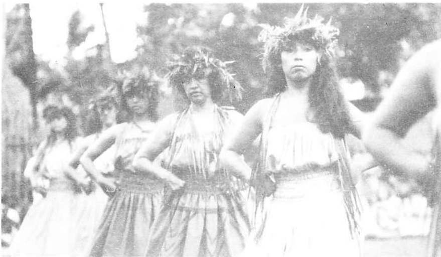
One of the highlights of the program was a performance by "Hui Ho'oulu Aloha" (the group in which love thrives), the dance troupe PCC proudly calls its own.