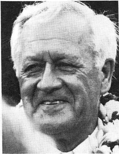
Sir James Henare

A distinguished group of fifty political, religious and cultural leaders, headed by Sir James Henare of New Zealand, will be special guests of the Center on Tuesday, September 18. The group is returning from the mainland where they have recently accompanied a national touring exhibit titled "Te Maori" or the Maori. The exhibit includes a collection of the finest Maori artifacts, and pieces of art, both ancient and contemporary, to be shown throughout the United States and later in prominent cities in Europe and other parts of the world.