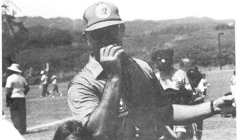
Everyone's Favorite Referee!

manager, spearheaded the organization of the Laie Region after his own son played with the Sunset teams. He sees the experience as invaluable for the kids. They learn the basics of good sportsmanship and play for the thrill of the game rather than simply to win. Each player is guaranteed a chance to play half a game each week. In soccer height and weight don't count nearly as much as an earnest desire to play, so