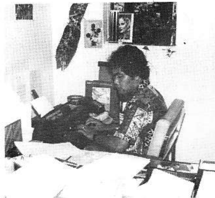
Logo gets to work