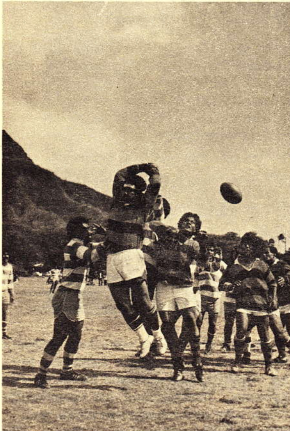
Employees play as hard as they work!