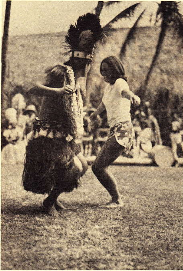
Work can be fun!