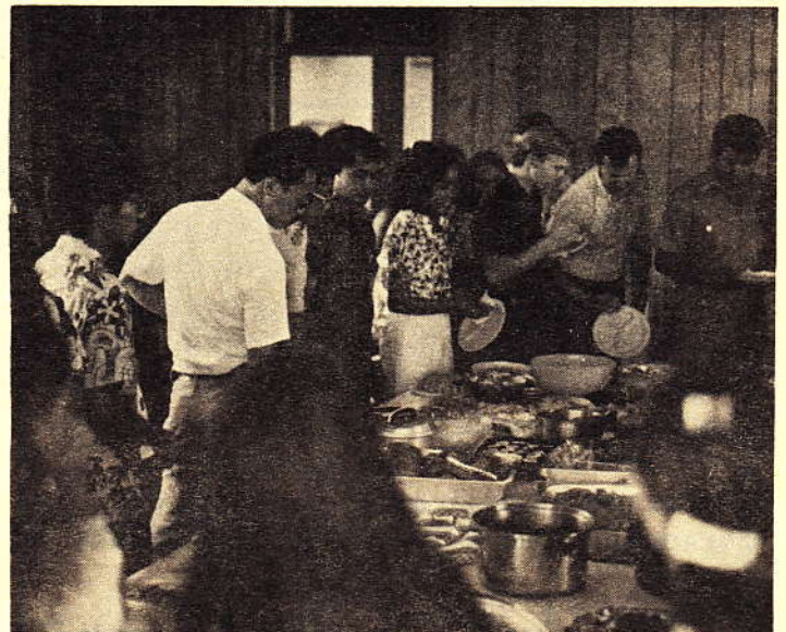
PCC employees at their favorite pastime.